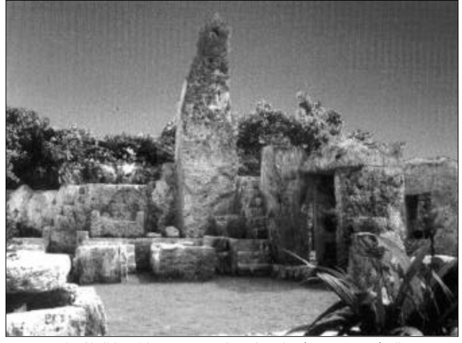
The Obelisk weighs 28.5 tons and stands 40 feet (over 12 metres) tall.

Unified Equation 2, relating to the Earth's magnetic fields: